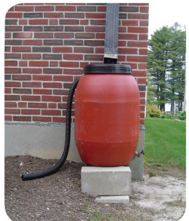
A rain barrel